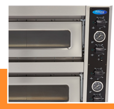
Easy analogue operation