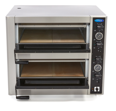
Large interior chamber with stone slabs