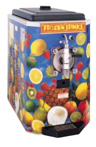
Shown with optional panel decals