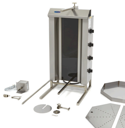
Easy to dismantle and clean