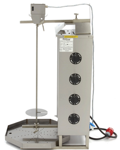
With adjustable skewer for perfect preparation.