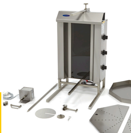
Easy to dismantle and clean