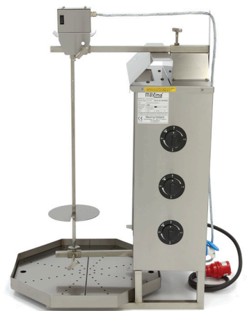
With adjustable skewer for perfect preparation.