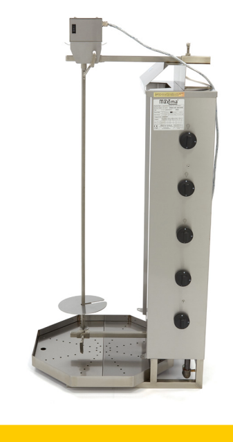
With adjustable skewer for perfect preparation.