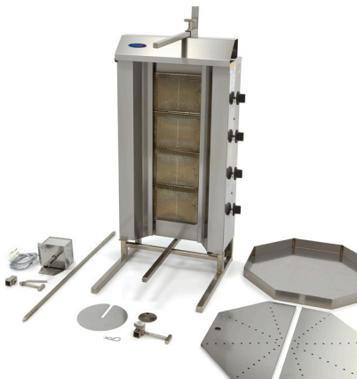
Easy to dismantle and clean