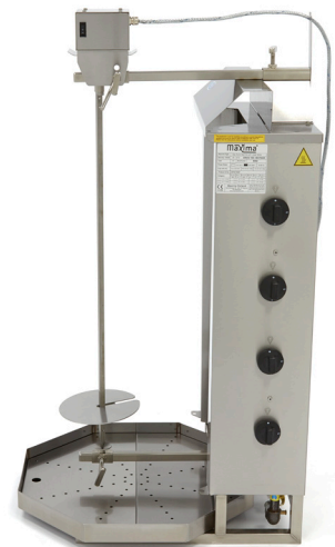
With adjustable skewer for perfect preparation.