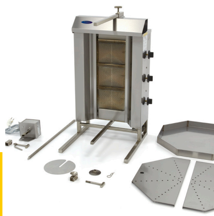
Easy to dismantle and clean