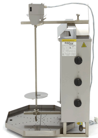
With adjustable skewer for perfect preparation.