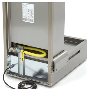
Gas inlet and electric cable on backside