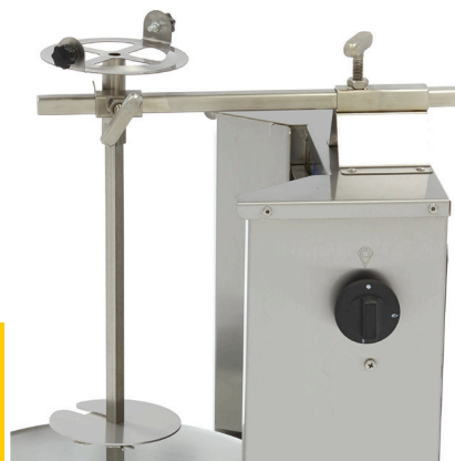
With adjustable skewer for perfect preparation.