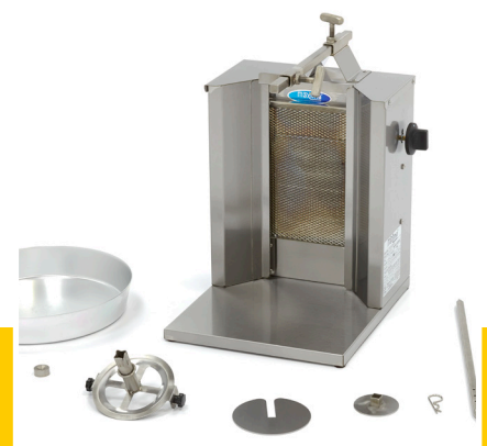
Easy to dismantle and clean