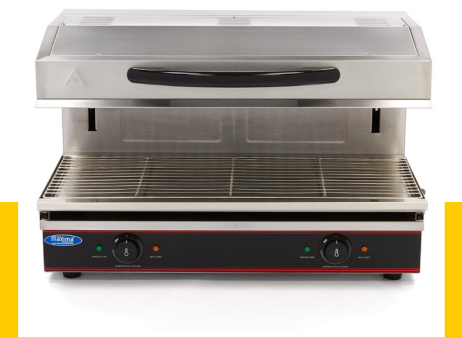
Easy to clean stainless steel crumb tray