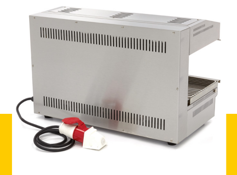
Heavy-duty stainless steel construction