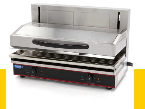
ift with suspension for any optimal position