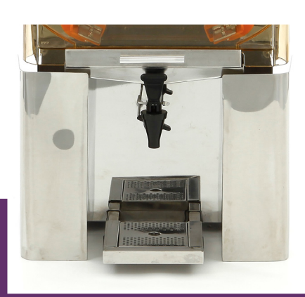
Stainless steel housing, with a maximum bottle / glass height of 28 cm