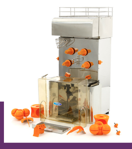
Easy to dismantle and clean