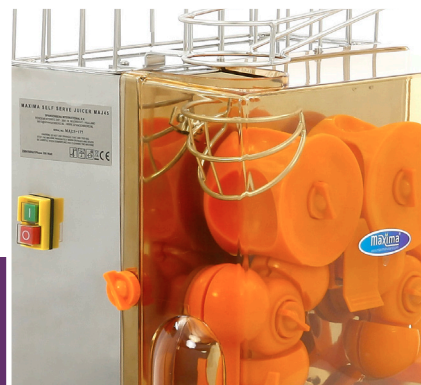
Anticorrosive press parts and on-off switch on the side