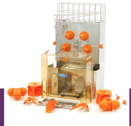
Easy to dismantle and clean