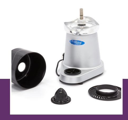
Easy to dismantle and parts are dishwasher safe