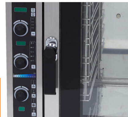
Digital controls for steam, temperature and timer