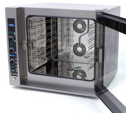
Easy to clean and to service