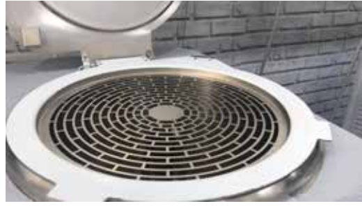
Stainless steel sieve grid.

Stirring system consisting of a fixed and a moving part that, working in synergy, ensure perfect product texture.