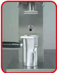
Anticorodal aluminium moulds. Spaghetti mould included