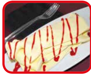
"Lasagna": an example realized with interchangeable moulds