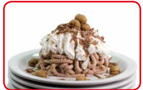
An example realized with "Spaghetti" mould