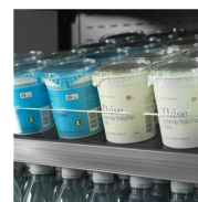
Adjustable shelves with tilting function