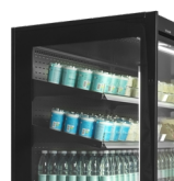
Glass end walls as standard