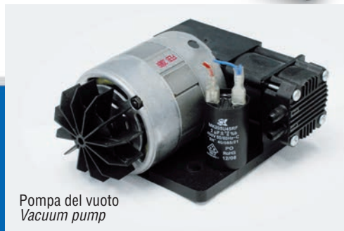
Pompa del vuoto Vacuum pump

Programma automatico per sacchetti grandi Automatic program for big bags