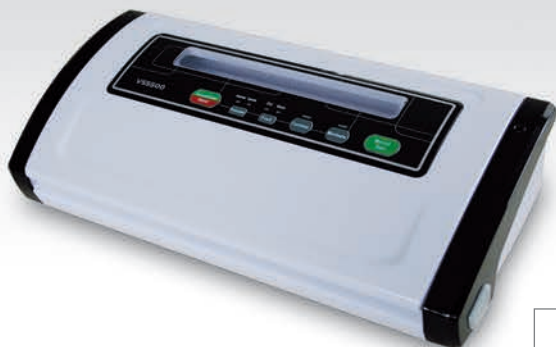
★ SILVER - ABS