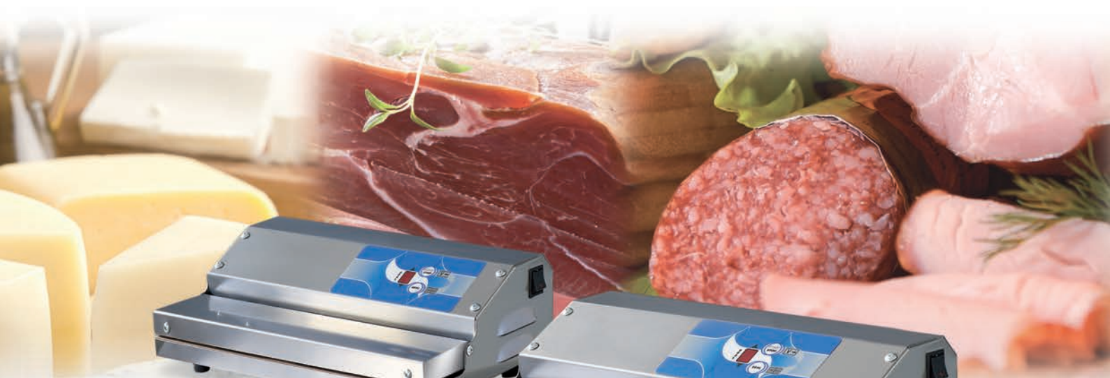
★ PREMIUM 350