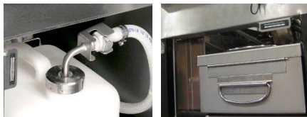
Oil replenished automatically from JIB for multi-well (left) or reservoir for 1-well (right)

Henny Penny Evolution Elite® open fryers use innovative filtering and oil level technology to extend oil life, improve product quality and reduce overall oil consumption and costs. Here's how: