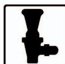
Self service tap