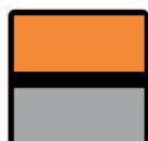
Orange / silver colour