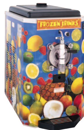
Shown with optional panel decals