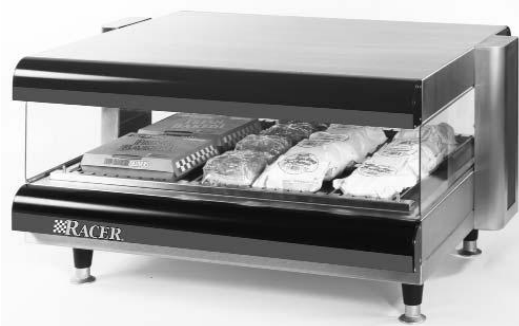
Model: Racer™ Horizontal Open Air Heated Merchandisers

*Warranty does not include rock grates, cooking grates, burners shields or fireboxes.